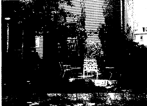
SHELTERED NOOK — Hidden from the street by the angle of the Potters' Centennial Home is this shaded terrace and garden at the back of the house.