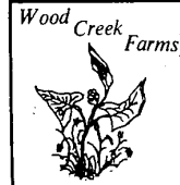
Wood Creek Farms