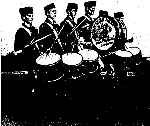
WESTWARD HO -- Getting ready to attend the Boy Scout National Jamboree in Faragut, Ida. are these members of Farmington Scout Troop 389's 35-piece marching band