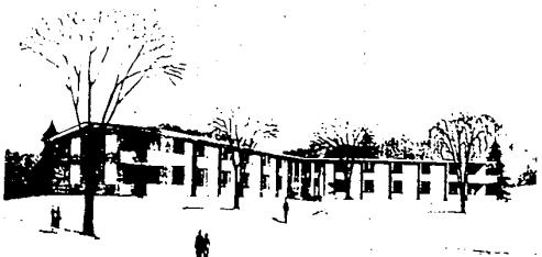
FIRST UNIT — This is an artist's sketch of the proposed first unit of a residence-retirement community to be built at Milford for members of the First Church of Christ, Scientist.

Twenty-three acres of partially-wooded land near Milford will be the location of a proposed new residence and retirement community for members of any Church of Christ, Scientist. The land is owned by the Greater View Foundation, a non-profit Michigan corporation, and preparations for the first unit have started. Christian Scientists of any age will be eligible to live in the community, and provisions are being made to give financial assistance to those who qualify in other ways. THE FIRST UNIT, to be built at an estimated cost of $950,000, include plans to house a maximum of 60 residents in single rooms and two-room units. Future units will include both single and multiple dwellings. The architects are O'Neil, Herrett and Luchebach, Inc., of Birmingham. Residents will provide some of their own furnishings, telephone, and housekeeping. The foundation will provide parking space, recreation facilities, organized activities for individuals and groups, basic furniture, a hobby room, beauty shop, and areas for entertaining guests; as well as light, heat, air conditioning, and three meals a day. As optional equipment in living quarters, residents may have a Pullman style kitchenette.