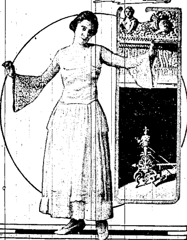
Evening Frocks Obey War Orders.

We're under orders as to evening gowns; the edict is that they must be simple. This is dictated by good taste in deference to the mood of the public. Designers are not expected to sit down in dull apathy and do nothing as long as war lasts, and on the other hand, they must not seem to forget the grim business that occupies so much of the world. The evening gown appears not to have suffered from this restraint in being gay. Designers have exercised so much cleverness with the simple at hand that there is room for thoughtfulness.