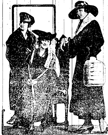
Adaptable and Popular Furs

To brighten up the dark-colored frocks for evening and for wear with other dark frocks, strands of bright colored beads have a special value. They are selected to emphasize touches of color that appear elsewhere in the costume, or to remove one-color dark frocks from somberness. Chinese beads are proving the most interesting, but strands made to order for special frocks draw their inspiration from many sources.