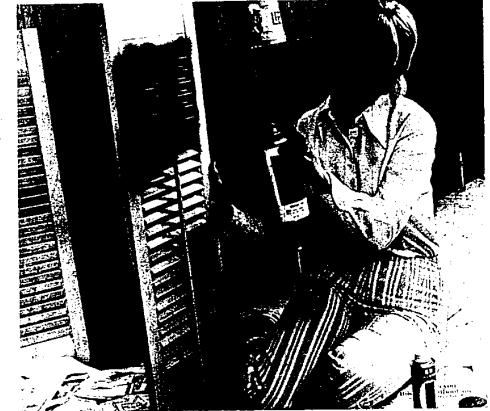
A NEW AEROSOL acrylic liquid stain makes a quick and easy job of finishing shutters, ornate furniture, fancy scroll work, picture frames and other hard-to-stain items. The spray stain dries quickly to a uniform color tone, and can be coated with varnish or other top coats after only 30 minutes of drying.