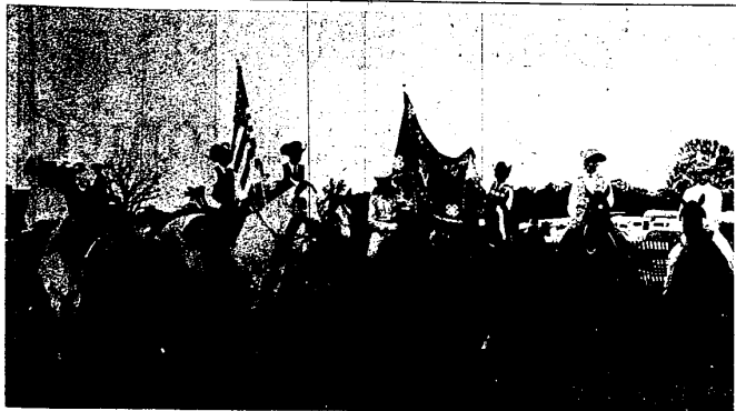
HORSE SHOW -- The Los Caballeros 4-H Club of Farmington was one of the highlights of last year's Festival horse show. This year they

Grand Rapids. It has 22 distributors in the lower peninsula and 12 in the upper. The Farmington winery also has a California subsidiary which handles the firm's imports from Spain, France, Italy, the Rhine Valley and other parts of the world.