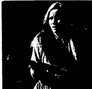
COVER — Eva Marie Saint provides protective cover fire for Gregory Peck when their ranch house is besieged by a crazed Apache killer in this scene from "The Stalking Moon." The film is showing at area theaters.