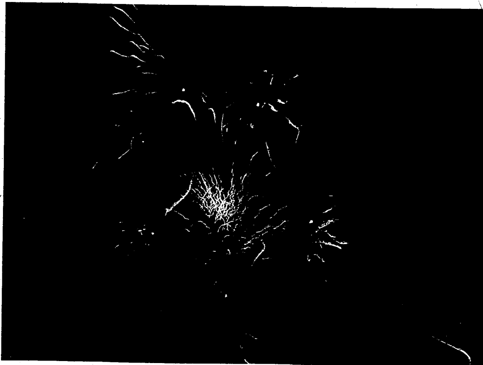
Fireworks Highlight Friday's Festival Presentations