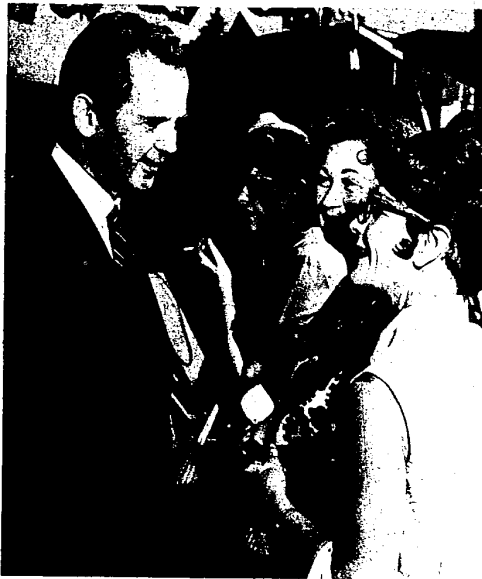
GOVERNOR'S GREETINGS — Governor Milliken was in Farmington Saturday to ride in the Founders Festival Parade and meet the folks of Farmington. The governor waves to the crowd and after the parade walks through the downtown