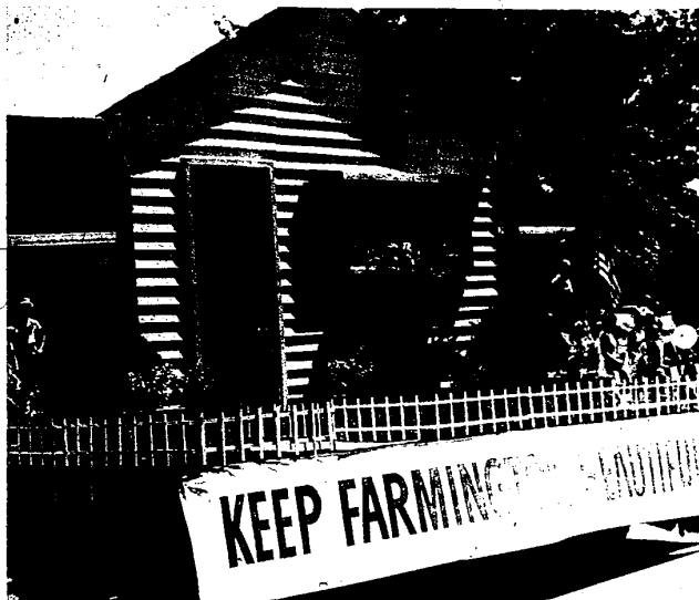
City Beautification Float Depicts Before And After