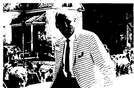
And Senator George Kuhn.