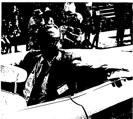
Grand Marshal Sid Abel Waves...