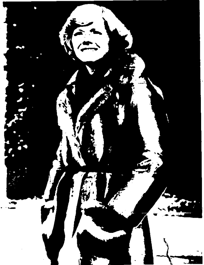
Practical and pretty, this short natural bassarisk coat was designed by Bill Blass.