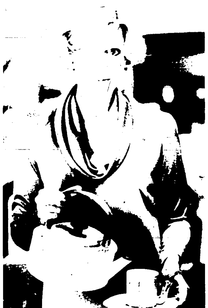
Birmingham model Linoah wears a shocking pink tunic outfit when she entertains at home. The 100 per cent polyester tunic over slim pants features a cowl neckline convertible to a hood.