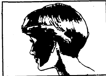
2101 Somerset Mall, Troy

CHILD BIRTH WITHOUT PAIN EDUCATION ASSOCIATION'S main office is now open from 12:30 p.m. Monday through Friday, at 20124 Woodward, Detroit.