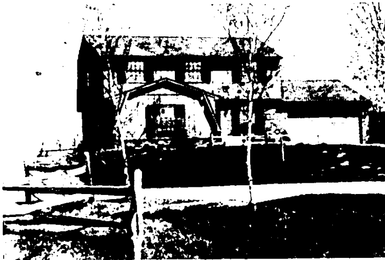
Beamed cathedral ceilings and a sunken living room are just two features of the Dunhill model offered by Winchester Development in Rochester Glen. The family room includes a fireplace and a wet bar. Prices start at $57,500 for houses in the development.

Although the condominium is still a relatively new phenomenon to hit the American housing scene, the HUD report concluded that "it is evident that condominiums have already taken over a dominant share of new for-sale housing in some areas