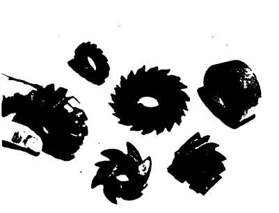
The steel cutting tool preforms which CMI produces include (left to right) a pipe reamer, a hog mill, blank, hob blank, spade drill and end mill. The gear-like edges below them are cutting tools, such as a shell end mill and stagger tooth milling cutter for twist drill.