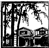
Monday, January 10, 1977