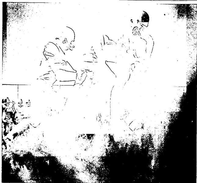
MAN WAS IT HOT! Garden City West graders picture shows the heat burning up through the grass sweltered through their opening practice session. This picture shows the heat burning up through the grass and dust on the practice field.