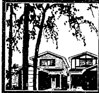
Monday, January 24, 1977