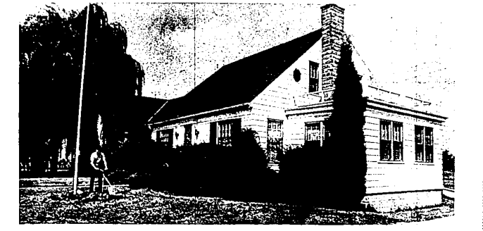
CHORE TIME -- Indoor and outdoor housekeeping absorbs a lot of energy of volunteers who use Newman House on Haggerty Road.