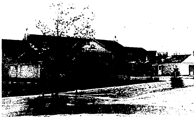
Williamsburg Village condominiums aren't lookalikes.