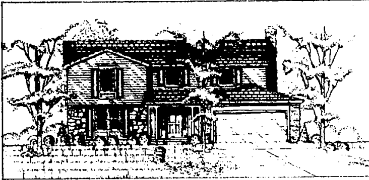
The Garland has 2½ baths and four bedrooms.