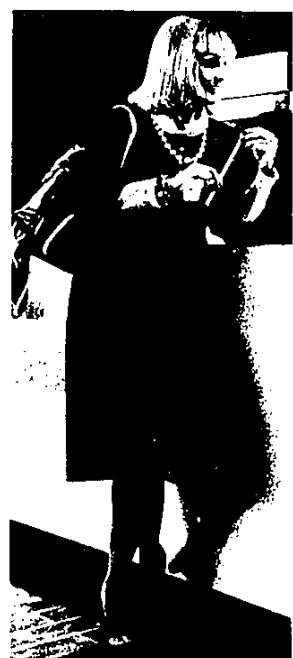
Everyone's right now dress is this navy and bright yellow knit by Crystal Plus. The top is blouson and the skirt is narrow.

And spring of 1977 is a season of flowers for accessories. Beautiful silk flowers are there for the picking—to wear in the hair, around the neck, in jewelry. It's a very special feminine touch.