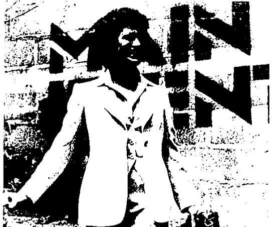
An off-white three-piece suit sports a white pin stripe and peak lapels.