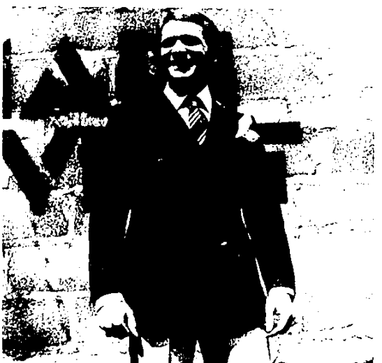
You can team a classic navy twill double-breasted six-button blazer with silver-grey flannel slacks.