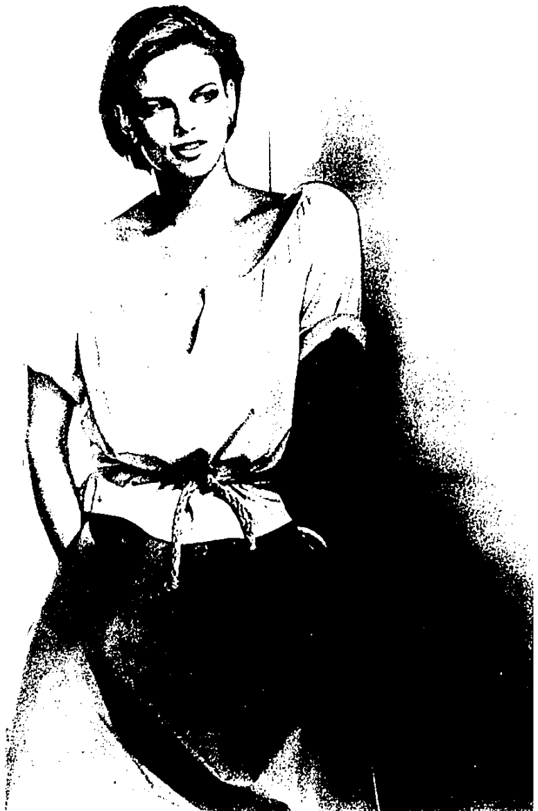
Calvin Klein highlights for spring the fastener that doesn't fasten.

"I like clothes that have a quality of impracticality about them but that really