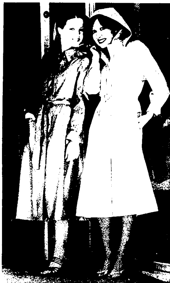
Soft and light raincoats are new on the rain scene from Lubad and Calvin Klein.

And of course you can count on Misty Harbor for a range of spring coats smart as they are practical, complete with Zepel treatment to resist rain and stains.