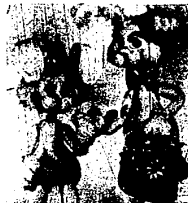
Show bunnies will perform.

The show will last approximately one-half hour and will be presented three times daily, at 1, 4 and 7:30 p.m. on the stage in the south mall of