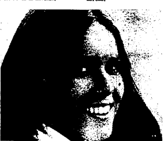
BARBARA HERSHEY appears as Sandy in the Allied Artists' production "Last Summer" based on Evan Hunter's explosive novel of today's teenagers. The film is now showing at the Camelot and Universal City theaters.