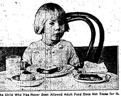
The Child Who Has Never Been Allowed Adult Food Does Not Tease For It.

(Special Information Service, United States Department of Agriculture.) SUITABLE DIET FOR THREE-YEAR-OLDS.