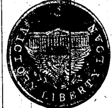
Front View of Medal.

The "busy Berthas" that spat their hell at Verdun are silent. Their fate has been decreed. They are to become medals of honor forwarded to the treasury department and volunteers in the Victory Liberty loan army. The mighty Krupp masterpieces are being melted up to make Victory Liberty loan medals. On one side of the medal will be a reproduction of the