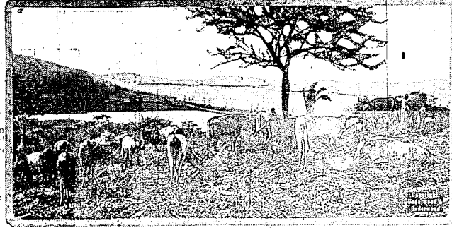
Aside from Columbian cattle imported into the canal zone by the United States government for breeding purposes, a number of thoroughbred Herefords have been secured from the States for the purpose, and these are grazing in the government-owned pastures near the Miraflores locks.