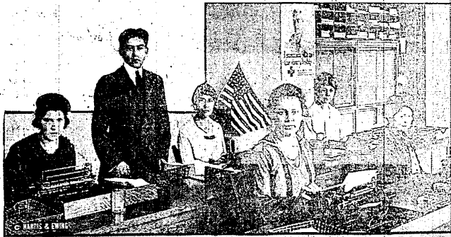
Indian words of the United States are not only educated by the government, but they are given an excellent opportunity to make good after they are ready to earn a living.