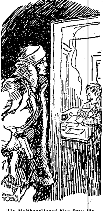
He Neither Heard Nor Saw Me.

"I awoke too late on the fifth morning, and I was too stiff to make much of a journey. I climbed to the edge of the glacier once again in the hope of discovering an approach.