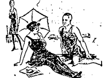
At the seaside too, the plump well-rounded figure is most admired.

The average person in beginning to realize more and more that the lack of physical strength and nerve exhaustion (frequently evidenced by excessive tiredness) are the direct cause not only of the failure to succeed in life's various enterprises, but also for the handicap in one's social and domestic life.