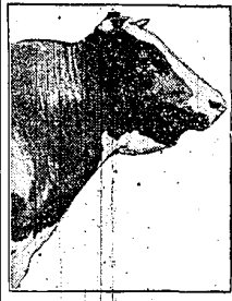
A Good Holstein Bull.

The New Windsor (Maryland) Bull Association has furnished production records of dams and daughters for three successive years. Each year the daughters have produced more milk and butter fat than their dams, which