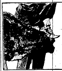
Animal Infested With Ticks.