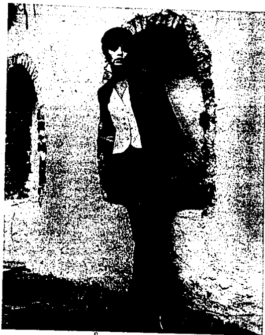
LEG WATCHERS WILL APPRECIATE the super-sleekness panty hose separates give pretty legs shown to advantage in Fall's short skirts. Panty Plus Hose lets you choose sizes in panty and hip-high stockings. Unique hold-band cuffs on the panty keep hose securely in place. By Beauty Mist.