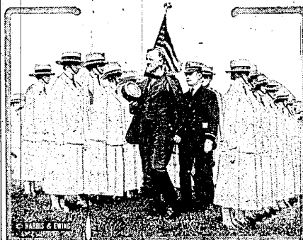
This photograph shows the yeomen (F) and marinettes of the United States navy being mustered out on the grounds of the White House. To the strains of jazz, reviewed by Secretary Daniels and naval officers, and with moments interspersed with wit and sorrow, the farewell was picturesque in its setting. They will be retained for clerical service in the navy department, assuming civil status.

Death. Death is nothing more or less than slipping back into your own subconsciousness, and so becoming greater and finer and more active—more useful, too—and with grander powers than we ever had in our limited imperfect bodies. Life is nothing but an episode in the universal life. Death is just a change of direction then, really; that's all.—From "The Promise of Life" by Algeron Blackwood.