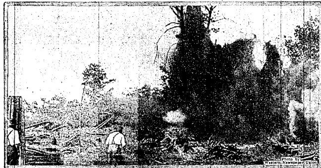
At Newark, N. J., a small army of men is busily engaged in clearing Heller field which, when completed, will be the first United States aerial mail landing field in the country. Our photograph shows the moment of detonation of a charge of dynamite beneath a mighty tree stump, which is torn from the grounds, roots and all.