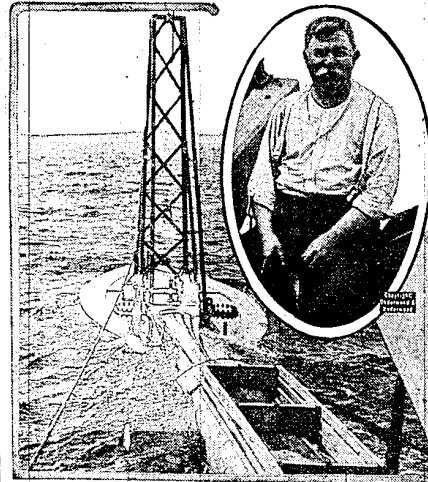
This new salvaging submarine, designed by Simon Lake, permitting men without divers' costumes to walk on the bottom of the ocean, was put to a severe test in New York harbor over the wreck of a government boat sunk during the war. At the right is a photograph of Mr. Lake.