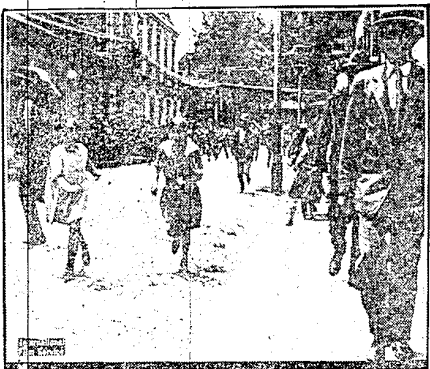
Citizens of San Jose, Costa Rica, fleeing before the troops of President Tenorio, who are clearing the streets with bayonet and bullet. Not much was left of the Costa Rican revolution because of the strict censorship maintained by Tinoco's government.