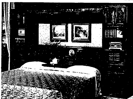
Pictured above and on display are a storage headboard, pier cabinets and light bridge.

Oak solids and pecan veneers are finished in a beautiful brown woodtone finish.