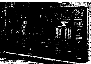
Pictured above and on display are just a few of the many wall units that are available.

The whole group is specially priced for 1 week only.