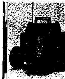
Sandblaster Race Car $1955