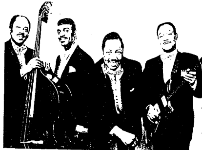
The Ink Spots sang their old favorites at Meadow Brook Music Festival in Rochester.