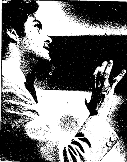
Scott Berg spent much of his speech giving advice editor Maxwell Perkins gave to the likes of F. Scott Fitzgerald, Ernest Hemingway and Thomas Wolfe.

Berg visited Perkin's ancestral home, Paradise, in Windsor, Vermont, once he was through researching. He had made a list of 100 people to visit and interview.