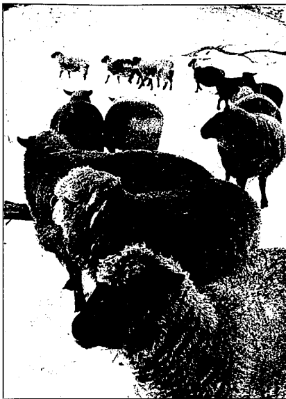
Sheep, out for a run on a winter's day, play follow the leader.