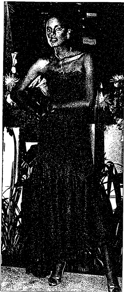
Andre Laug's evening dress is the deepest gleam for after dark — gold on black chiffon with his own asymmetrical hemline. The fabric is spun metallic that hugs the body yet ruffles at the strapless top and from the thigh down. He calls it his "hug me" fabric. Saks Fifth Avenue.