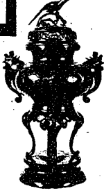
Large Antique Japanese Bronze Pierced Cover Koro on Attached Base, 24 1/2" high