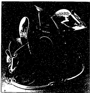
The Jourdan evening dance pump and its matching belt will make you the focus of attention, especially when it is interpreted in burnished gold. The frankly Hollywood influence even extends to its name, The Hollywood.