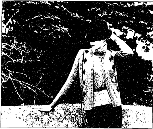
Twins are in this fall, particularly when Jaeger gives them the classic treatment. Here, an Intarsia crew neck sweater of 100 percent lambs wool is topped with an Intarsia v-neck button front sweater, also in 100 percent lambs wool. The shades are blonde, spice, brown, dark grey, and pheasant.