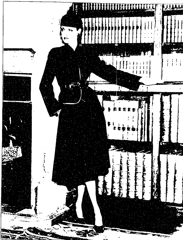
Velvets point up the return to elegance by day and night. During the day Jaeger's velvet blazer is teamed with a wool jersey print skirt; but for nighttime sophistication it is spectacular with its own matching 100 percent cotton velvet skirt. Jaeger. Somerset Mall.