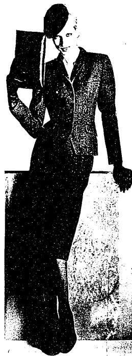
Don Sayres presents sophisticated shaping in aubergine pebble tweed, a look of hourless elegance. The shorter Chesterfield jacket with cutaway front is touched with velvet and matched to a narrow back slit skirt.

The Western look. No longer just a cowboy outfit. It's a fashion way of life. As inspired as high noon on the plains. From the small-collared plaid flannel shirt and nipped-in vest to the indigo-dyed denim skirt. Tailored lanky as a cowhand. With all the details of your favorite blue jeans. Like contrast stitching, five pockets, zip-fly front. Plus a way-out-Western belt. In cotton denim, poly/cotton flannel, 100% acrylic. Juniors, this is how the West was worn! Shirt, $14 Vest, $9 Skirt, $17