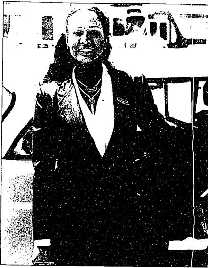
She's all business, the sophisticated professional, and you can tell it from her no-nonsense look that includes gold and black enamel necklaces worn with matching bar pin and earrings. Designs by Trifari.