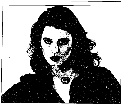
Black sits squarely on a golden chain, to focus attention on the face. As predicted, black has emerged as the leading fashion accent keyed to ready-to-wear this fall.