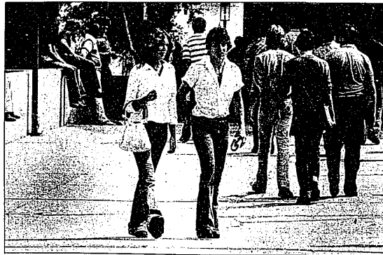
Strolling through campus, students adjust to their return to the scholarly life at OCC.