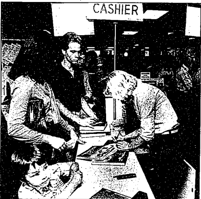
New semesters begin with a traffic jam at the OCC book store.