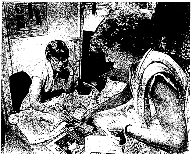
Something new at the center

Tuesday, Oct. 9: Farmington Area Arts Commission regular monthly meeting at 7 p.m. in Farmington Hills City Hall, 31533 11 Mile Rd. Open to all interested persons.