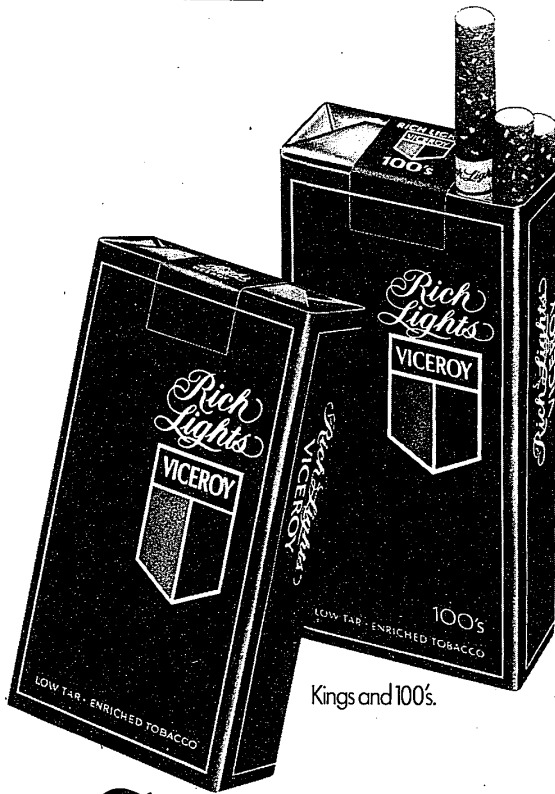
Kings and 100's.

9 mg. "tar", 0.8 mg. nicotine av. per cigarette by FTC method.