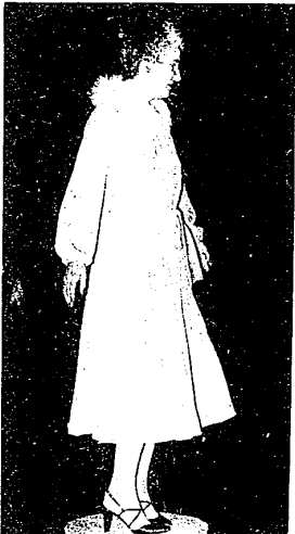
Even dress-up clothes are made with the simple line. The chiffon number from France looks like it will float away by itself when unbelted.

"It is something some women just don't have a knack for and something some just seem never to be able to learn," she said.