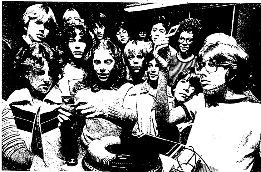
The finished product — a slide show presentation of Farmington and environs — is examined by Warner Junior High students who put it together last spring.